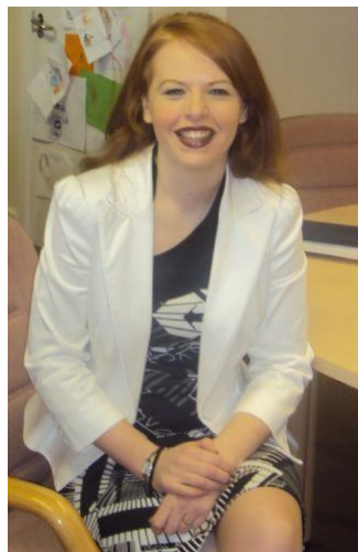
Designated Safeguarding Lead