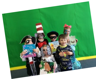
Celebrating World Book Day

Learning to read is the most important skill children will ever learn and so, quite naturally, it is a priority in our school. Throughout the week all children take part in reading activities at least once a day. There may be shared stories and rhymes, reading during Literacy/topic lessons, individual reading with a member of staff/volunteer and across KS1 & 2 every child is involved in guided reading four times a week.